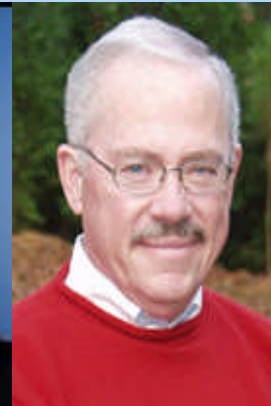
Honorable Bob Barr